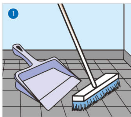
1. Remove loose dirt