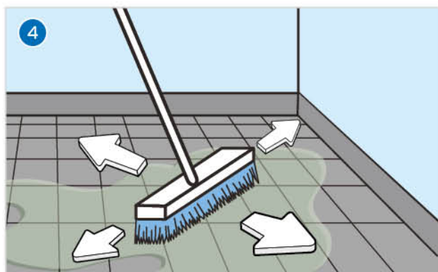
4. Scrub the floor using a brush