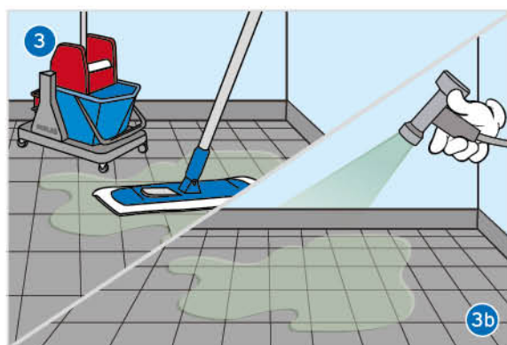
3. Spread the solution on the floor