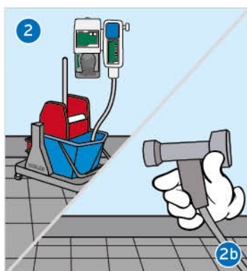
2. Use mop and bucket or spray gun to dose correctly